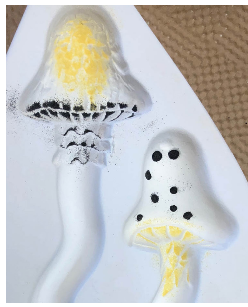
Sift Powdered Butterscotch Opal frit in the cap of the tall mushroom and in the fringes of the short mushroom.