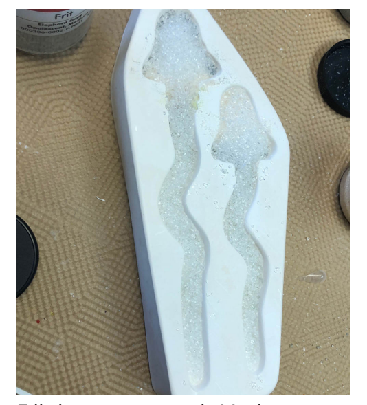
Fill the cavities with Medium Grain Clear frit until the tall mushroom cavity holds 62 grams frit and the short mushroom cavity holds 48 grams frit.