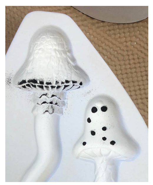
Place Black Powder in the dots on the short mushroom cap and at the rim and fringes of the taller mushroom.