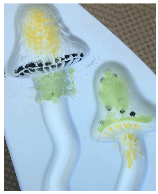
Sift Powdered Pea Pod Opal into the fringes of the tall mushroom and over the black dots in the cap of the short mushroom.