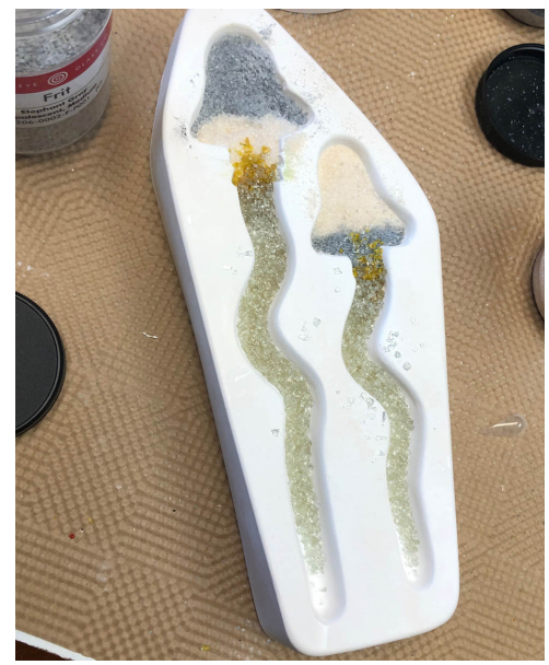
Place a thin layer of Medium Grain Rhubarb Shift Tint Tint frit along the length of both stems.