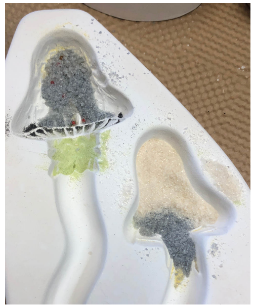
Place fine Marzipan Opal frit into the top part of the cap of the shorter mushroom and into the Gil and fringe area of the taller mushroom.