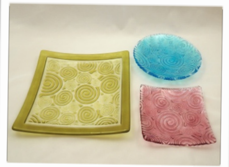
Variation #3: Shows range of shape and sizes that can be created