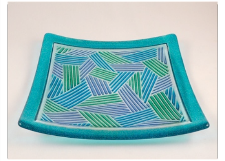
Variation #1: Uroboros Teal Green, Light Blue, and Deep Aqua frit