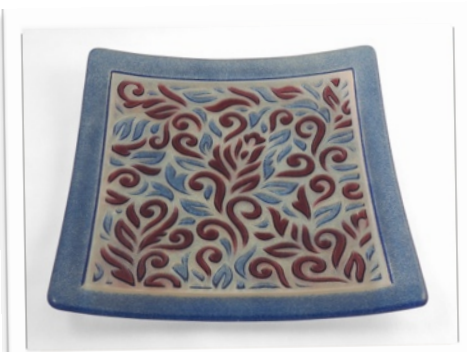
Variation #1: Turns Pink and Light Blue frit and Spectrum Double-Thick Clear