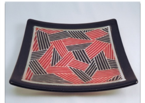
Variation #1: Black and Cherry Red frit topped with Spectrum Double Thick Clear sheet glass